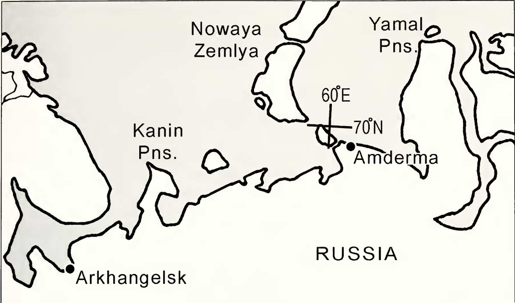
Fig. 1. Location of Amderma.